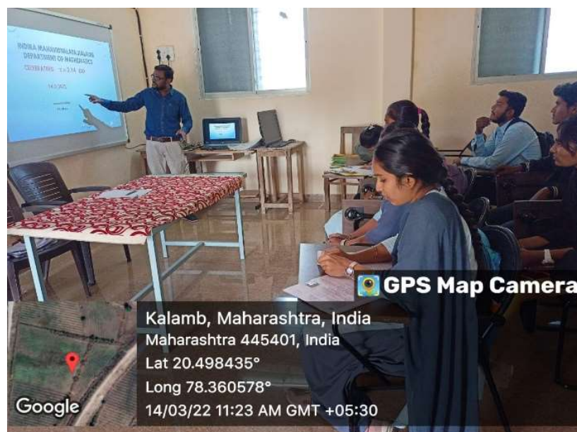
Expert Delivering Lecture on Tricks for Competitive Examination, Date: 14/03/2022